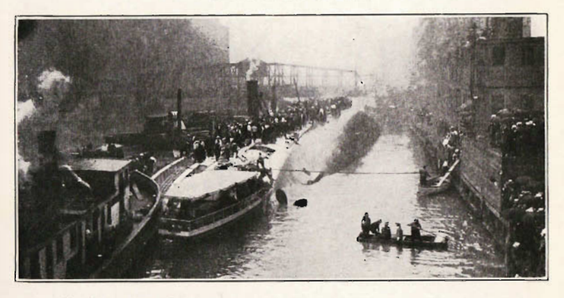
Looking toward Clark street bridge one hour after disaster.