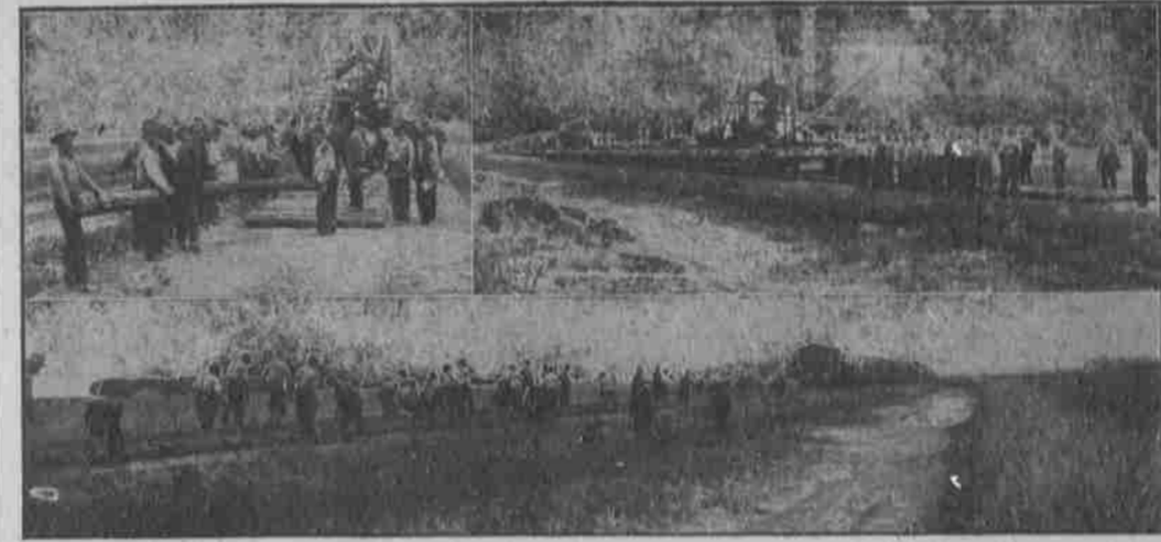
View 1 shows the tie gangs working in front of the pioneer car and the track-laying machine. The ties are lined up to a rope at the right end of the ties, at proper distance from the center stakes.

During nine hours on this date the crew of 134 men, which was short forty men of the full organization, handled 46 cars of material, consisting of 1,055,000 pounds of steel rails—75 pounds per yard—11,520 ties, with all the necessary bolts, angle bars, spikes, crossing material, etc. All this material was unloaded as the train proceeded over the track as laid. Practically all of it was handled by machinery to the "pioneer car" at the front of the track-laying machine. At the "front" the 960 rails were handled by a crew of three men, while nine gangs of two men each laid the 11,520 ties.