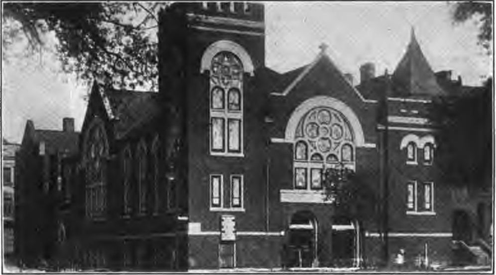
ST. MARK M. E. CHURCH