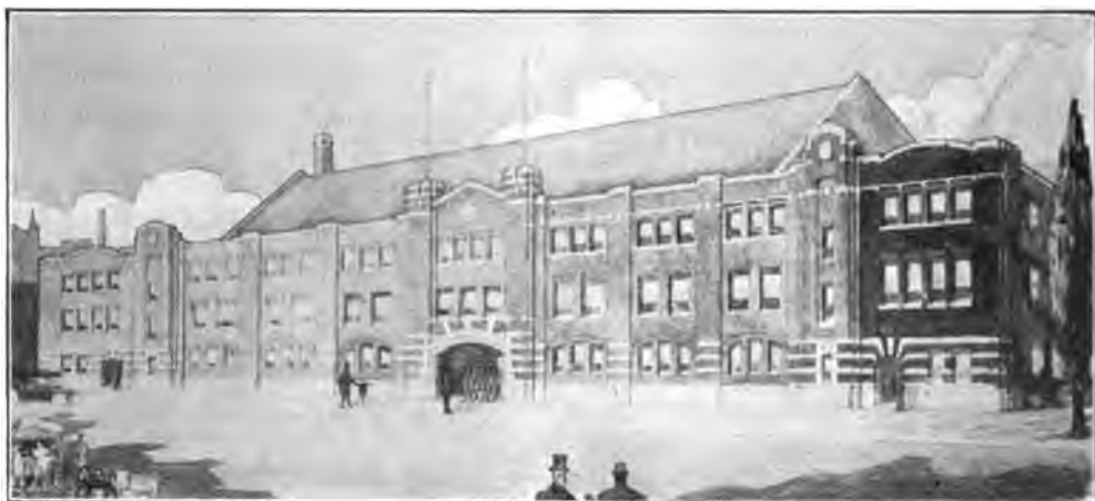
THE EIGHTH REGIMENT ARMORY