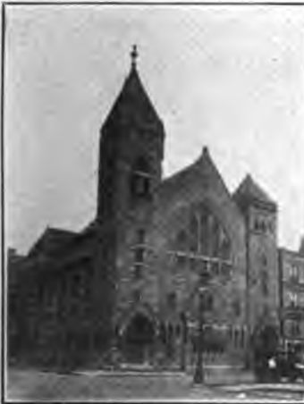
QUINN CHAPEL (A. M. E.)

The Eighth Regiment, of which he was elected colonel in 1914, was first mustered in as a battalion in 1895. In 1898 it was raised to regimental strength and saw service in the Spanish