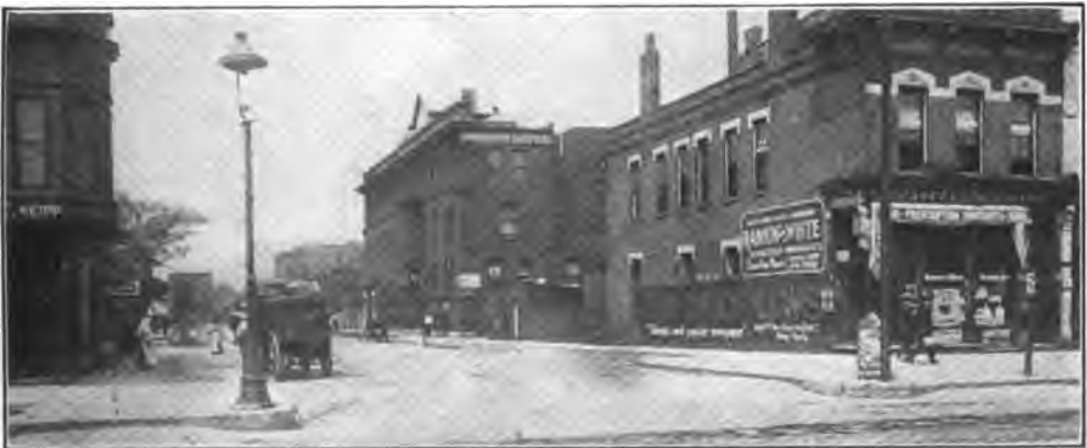
PROVIDENT HOSPITAL AND VICINITY

☐ The most noted colored physician in the United States is Daniel Hale Williams who was born in Pennsylvania in