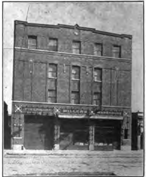
THE MILLER WAREHOUSE

although no exact statistics are available. There are thirty or more colored churches in the city, a fine hospital, the Provident, four social settlements working chiefly among colored people and the Young Men's Christian Association with a building which cost $195,000 and a membership of 2,000. There is an Old Folks' Home, a Home for Colored Working Girls, a League of Colored Women's Clubs, the Amanda Smith Industrial Home and a large number of social clubs like the Appomatox. Out of the mass of colored folk in Chicago have risen numbers of distinguished people who have made their mark in city life and even in the life of the nation quite independent of their race or color. As compared with other cities colored Chicago is noted for its push and independence, its political aggressiveness and its large number of middle class working people who are doing well. As teachers in the public schools, and public officials, the Chicago colored people have more than maintained their proportionate quota. In business and industry they are still behind but pushing rapidly forward. Small wonder that a progressive, alert group like this should maintain the largest circulation, per capita, as buyers of THE CRISIS .