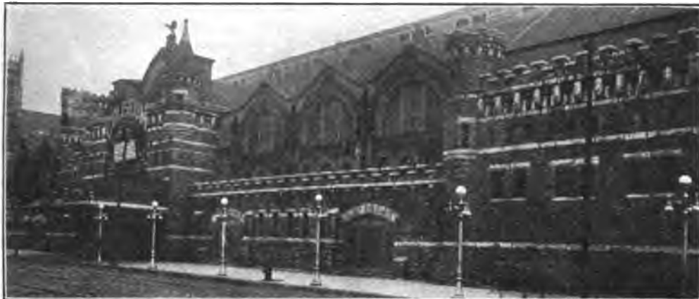
WHERE THE EXPOSITION WILL BE HELD

years of age with a wife and two sons. He was originally a painter but is now engaged in the real estate business and has long been prominent in politics.