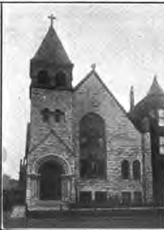
ST. THOMAS (P. E.)