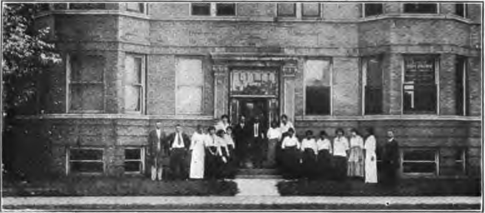
THE OVERTON HYGIENIC MANUFACTURING COMPANY