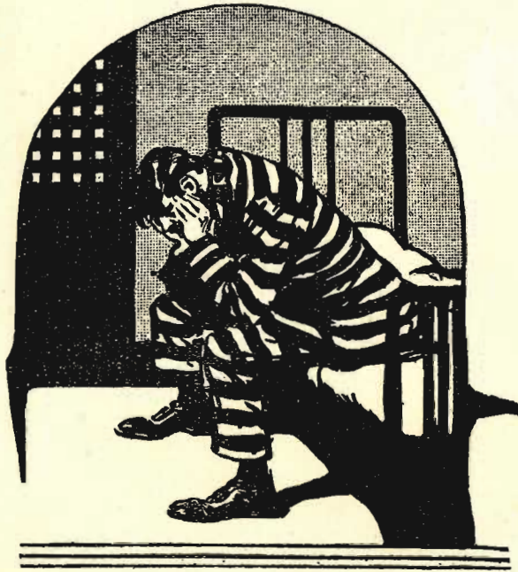
OUR ERRING BROTHER IN QUOD The old boy is thinking it over

Drawn Expressly for THE CHRYSALIS by an Inmate of Sing Sing.