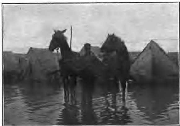
AFTER A DAMP NIGHT