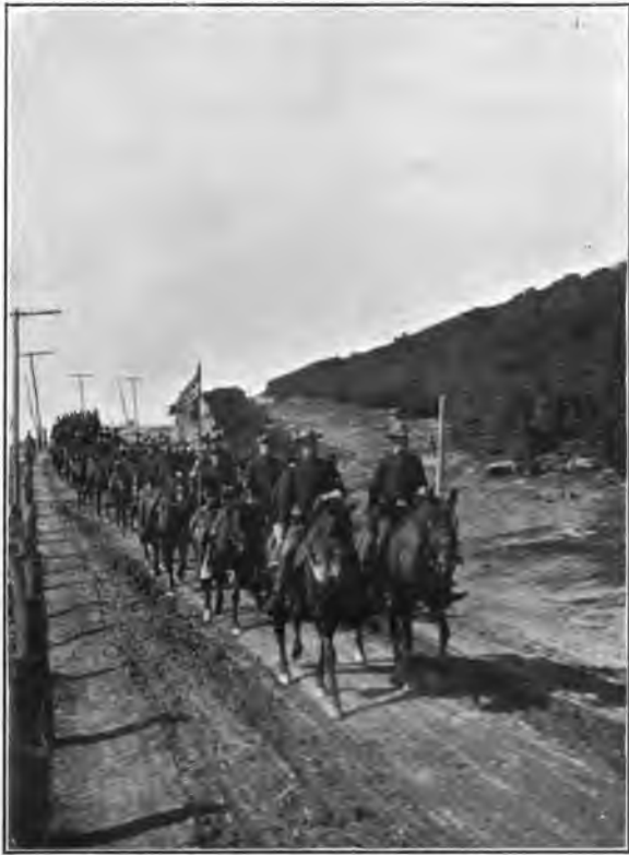
SECOND TROOP, PHILADELPHIA CITY CAVALRY, AT SIENANDOAH